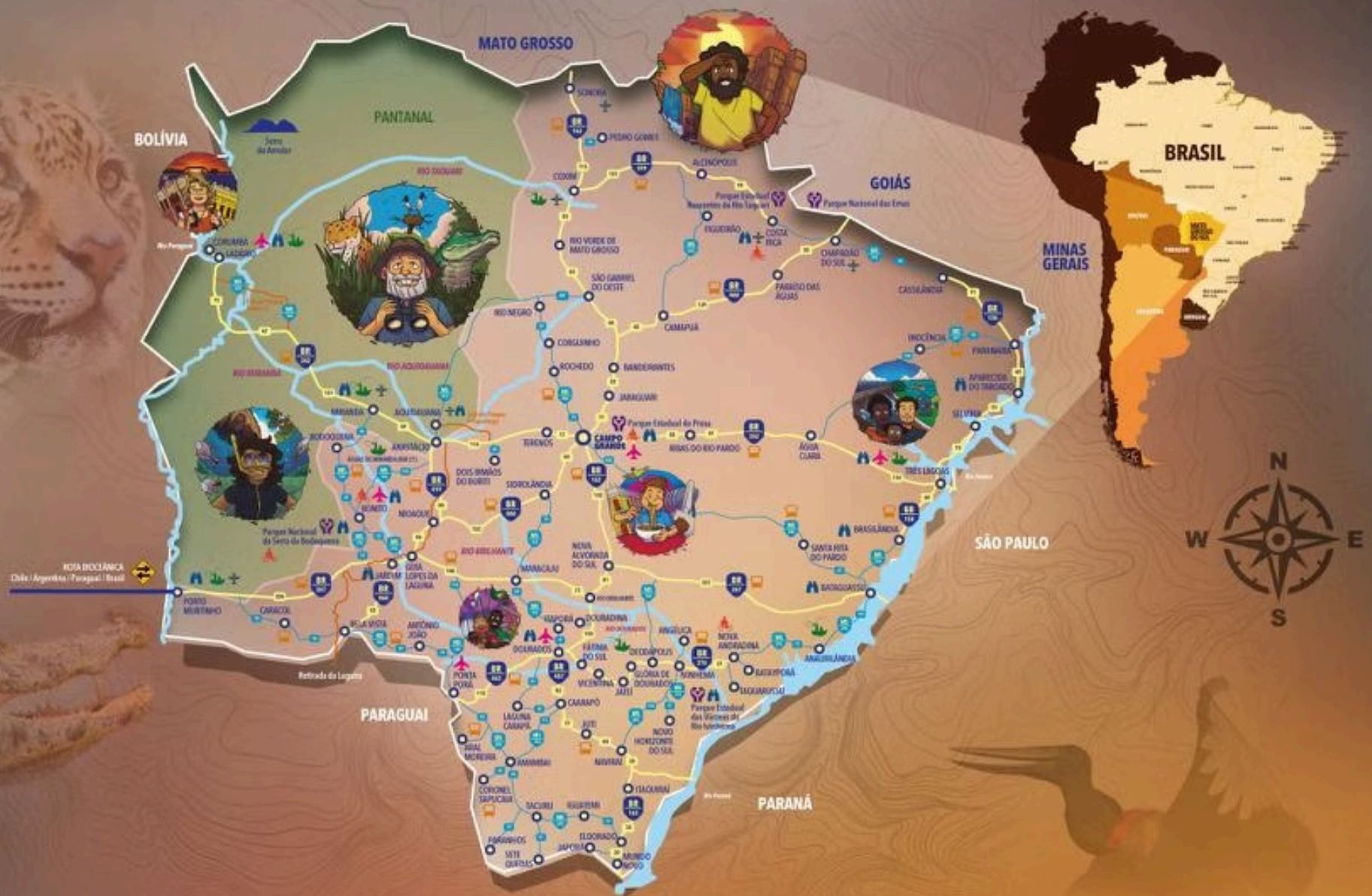
A circular route itinerary